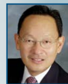
JUSTICE MING W. CHIN (Ret.) Former Calif. Supreme Court Justice ADR Services, Inc. KEYNOTE CONVERSATION