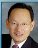
JUSTICE MING W. CHIN (Ret.) Former Calif. Supreme Court Justice ADR Services, Inc. KEYNOTE CONVERSATION